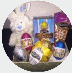
Fleur Featherstone won our Easter Giveaway (yum!)