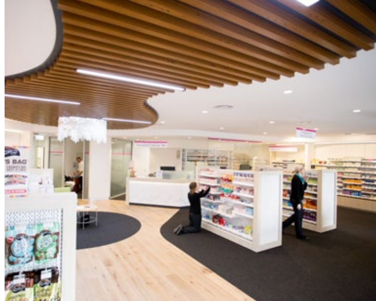
The interior is bright and spacious and is designed with accessibility in mind.