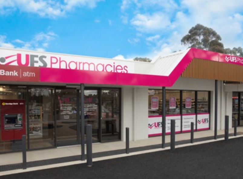
The entrance to the new maiden Gully pharmacy features double automatic doors and a Bendigo Bank ATM.